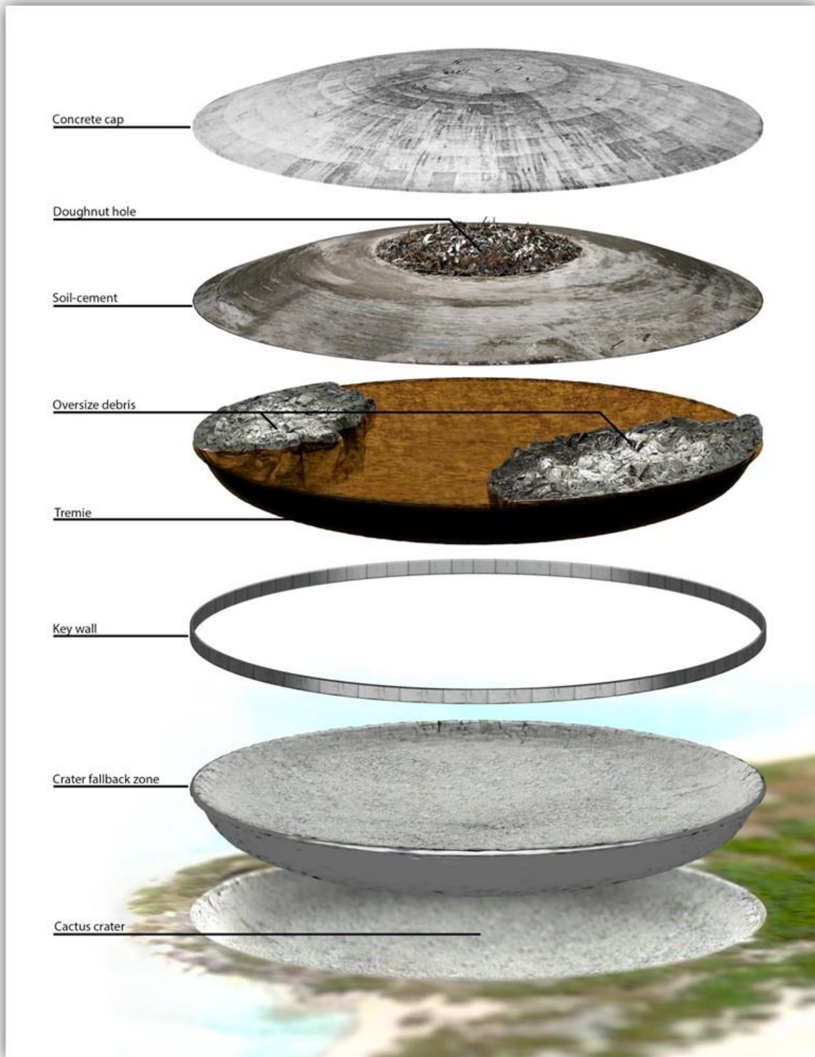
Design elements of the Cactus Crater containment structure